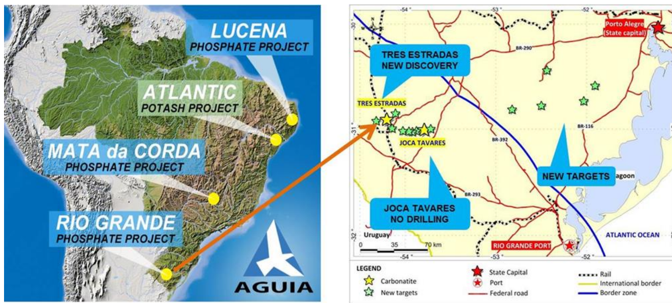
Figure 1: Location of Rio Grande Phosphate Projects, SE Brazil

With the granting of the tenements the Company can now plan a detailed timeline to continue its efforts to commercialise its flagship Três Estradas phosphate project through resource expansion, scoping and further phosphate beneficiation optimisation test work. Drilling programs of both reverse circulation to test the shallow oxide zone and deeper diamond drilling to test the primary zone are currently being prepared.