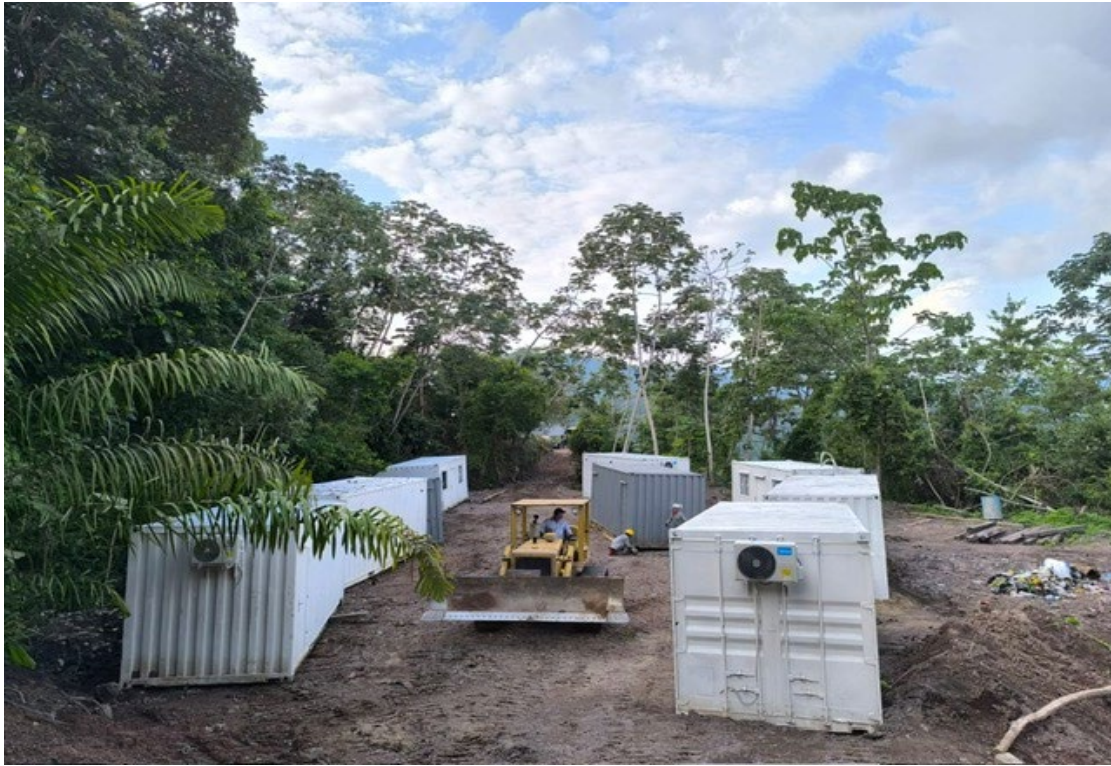
FIGURE 5: NEW CONTAINERISED CAMP AND MINE BUILDINGS BEING CONSTRUCTED