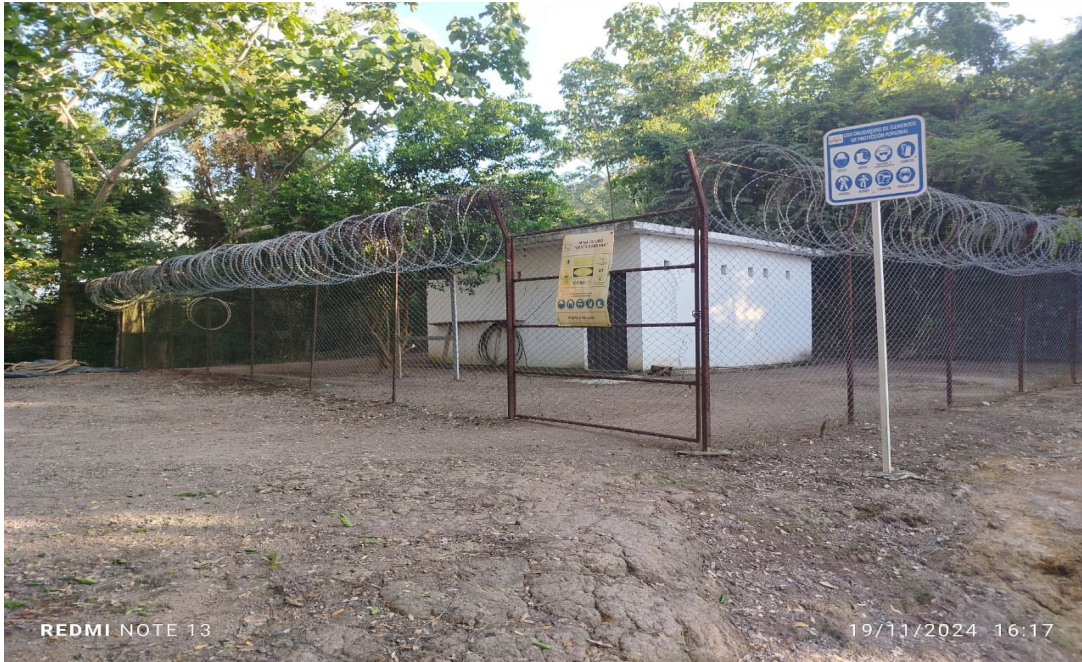
FIGURE 3: EXPLOSIVES MAGAZINE, SANTA BARBARA PROJECT