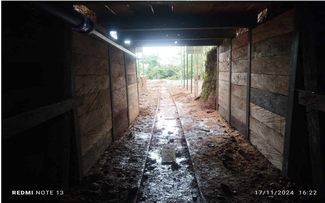
FIGURE 1: NEWLY SUPPORTED AND REHABILITATED SANTA BARBARA ADIT ENTRANCE