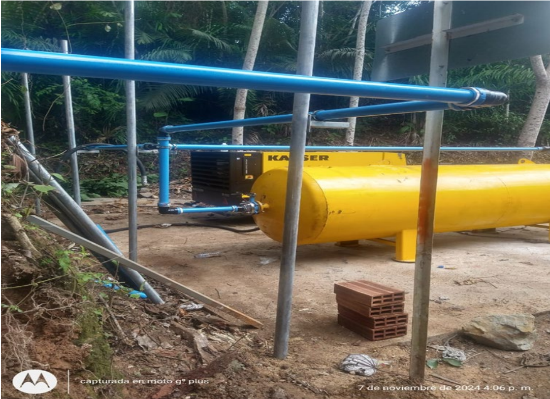
FIGURE 2: NEWLY INSTALLED COMPRESSED AIR SYSTEM FOR UNDERGROUND PRODUCTION DRILLING