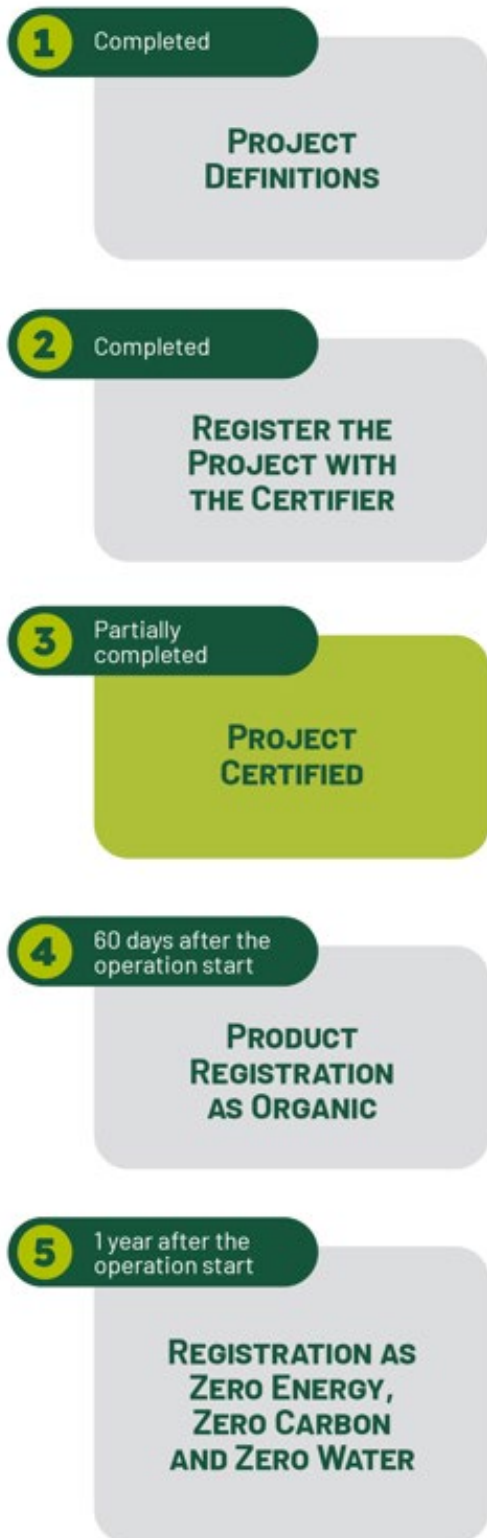
FIGURE 1. PLANNED TIMELINE OF ACTIVITIES TO RECEIVE NET ZERO CERTIFICATION